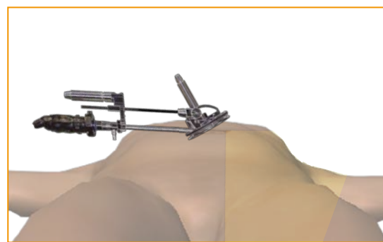
Optimal ring positioning for 30° laparoscope

To obtain same field of view with a 30° laparoscope, the ring is angulated of an additional 30°. The position and angulation of the ViKY base can be quickly and easily adjusted as needed during the procedure to maintain optimal visualization of the targeted surgical site.